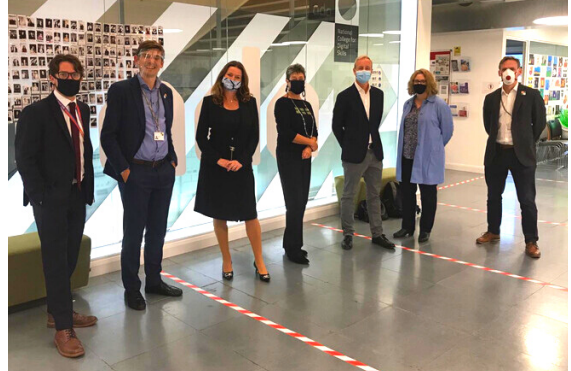
Minister Keegan (second from left) visits Ada, September 2020

that finding these opportunities is not easy, nor is it always a fast process, but encouraged students to, "just never give up, and never stop learning." She highlighted the importance of studying subjects where there are current skills gaps and qualified students will be in-demand by employers.